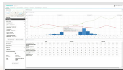
Forecast view for several parameters (e.g. temperature, precipitation) for the next 2.5 days in 3-hourly timesteps