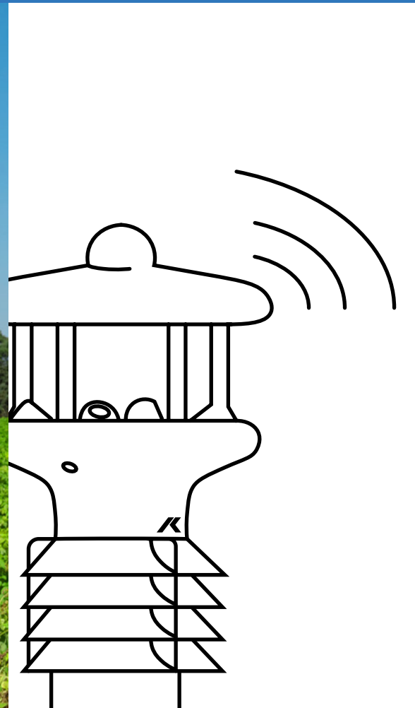
FieldRay Plant Protection - Agrimeteorological Monitoring Station: Rain Gauge with solar panel (left), Weather Station that measures wind speed, solar radiation, temperature, relative humidity, wind direction (right)