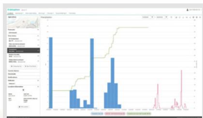
Precipitation: observed (blue) and fore- cast (red) in one single view